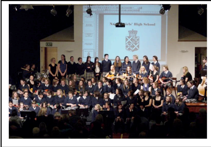
Students at Napier Girls' High School enjoy singing the NZMM song, Made in New Zealand

The NZ song has been very much enjoyed by our students. We started teaching in back in music month but due to the craziness of term 2 we didn't get around to doing the official 31 st of May performance! So we did our own. Last month we had our school Arts Evening and as the final item we performed the NZ song. The song worked really well in the "massed" performance situation. We had the Ukulele Orchestra, guitar group, school choirs singing the two parts, a piano, 2 double basses and the drums. It was a great, positive way to conclude the concert and everyone went home buzzing! Thanks for the great song.